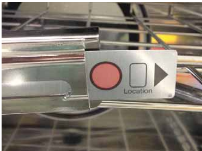
Machine chamber loaded with a Wash-Check Monitor prior to disinfection cycle.

Cleaning efficacy tests demonstrate the ability of the washer disinfectors to remove soiling which occurs during normal use of re-usable human waste containers. Due to the extent of the contamination that occurs both naturally and during use it is impossible to test for every possibility. Protein is a component of the majority of contaminations so it is this that most test methods focus on. We use Wash-Check Monitors which simulate human blood, tissue debris and faeces. These Monitors are approved to the Australian Standard AS/NZS 4187:2014.