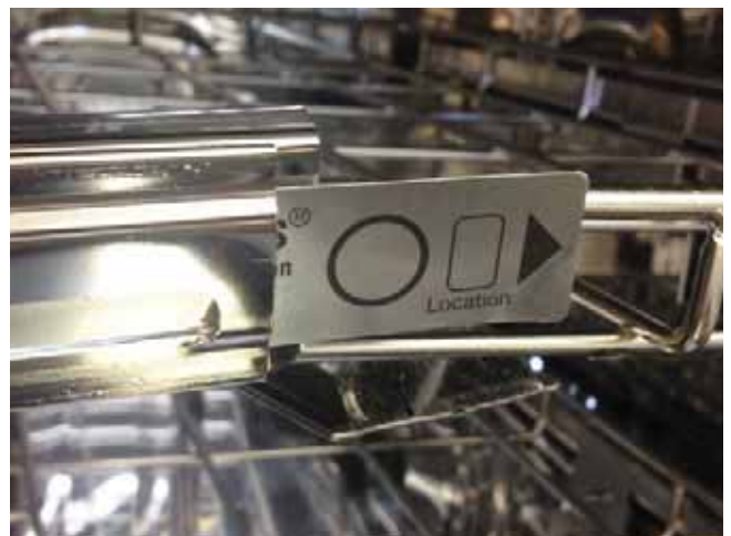
After a disinfection cycle the Wash-Check Monitor is checked for a result.